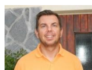
Michele Crosetto.